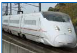
Kyūshū Shinkansen "Series 800" Kyūshū Shinkansen (288.9 km) Train Names: MIZUHO*, SAKURA, TSUBAME