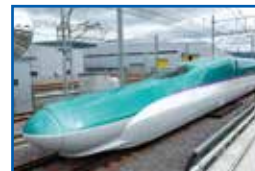
Tōhoku & Hokkaido Shinkansen "HAYABUSA" etc. Hokkaido Shinkansen (149.0 km) Train Names: HAYABUSA, HAYATE