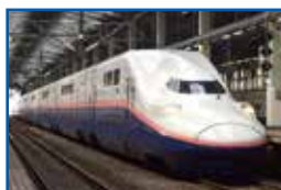
Jōetsu Shinkansen "Max-TOKI" etc. Jōetsu Shinkansen (333.9 km) Train Names: TOKI, TANIGAWA Max-TOKI, Max-TANIGAWA