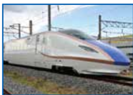
Hokuriku Shinkansen "KAGAYAKI" etc. Hokuriku Shinkansen (450.5 km) Train Names: KAGAYAKI, HAKUTAKA, TSURUGI, ASAMA