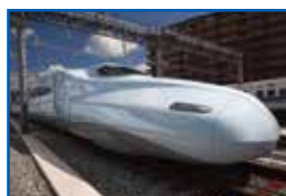
Sanyō & Kyūshū Shinkansen "SAKURA" Sanyō Shinkansen (622.3 km) Train Names: NOZOMI*, MIZUHO*, HIKARI (incl. HIKARI Rail Star), SAKURA, KODAMA (Tokyo thru Hakata, 1,174.9km)