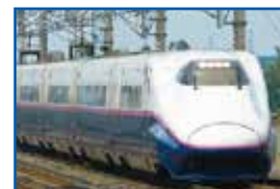
Tōhoku Shinkansen "HAYATE," "YAMABIKO," etc. Tōhoku Shinkansen (713.7 km) Train Names: HAYABUSA, HAYATE, YAMABIKO, NASUNO