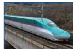
Tōhoku & Hokkaido Shinkansen "HAYABUSA" etc.