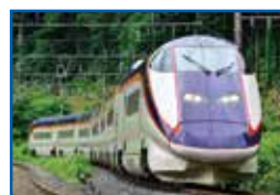
Yamagata Shinkansen "TSUBASA" Yamagata Shinkansen (421.4 km) Train Name: TSUBASA