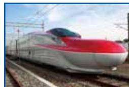
Akita Shinkansen "KOMACHI" Akita Shinkansen (662.6 km) Train Name: KOMACHI