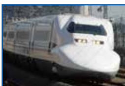
Tōkaidō & Sanyō Shinkansen "HIKARI" Tōkaidō Shinkansen (552.6 km) Train Names: NOZOMI*, HIKARI, KODAMA